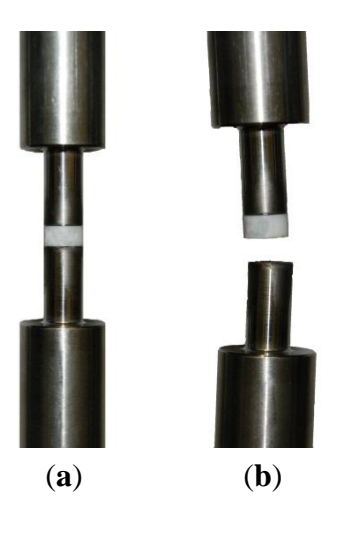
Figure 1. (a) Setup for adhesive strength test sample prior to testing; (b) Sample after testing.

To evaluate the adhesive strength of the coatings on the ceramic body the TZP-A discs were connected to titanium (Ti6Al4V) cylinders with a diameter of 10 mm (see Figure 1). The cylinders were blasted with Al_2O_3 (EK 80) on the end faces. The surfaces were connected using a bonding agent (HTK Ultra Bond 100, HTK Hamburg GmbH, Hamburg, Germany) that cured for 50 min at 180 °C under mechanical pressure. The pull-off test was performed with a universal testing machine (Z050, Zwick GmbH & Co. KG, Ulm, Germany) at a crosshead speed of 5 mm/min. Maximal force was measured and related to the surface area giving the adhesive strength for HT1 (sandblasted and sandblasted/etched), LT1 and LT2 specimens.